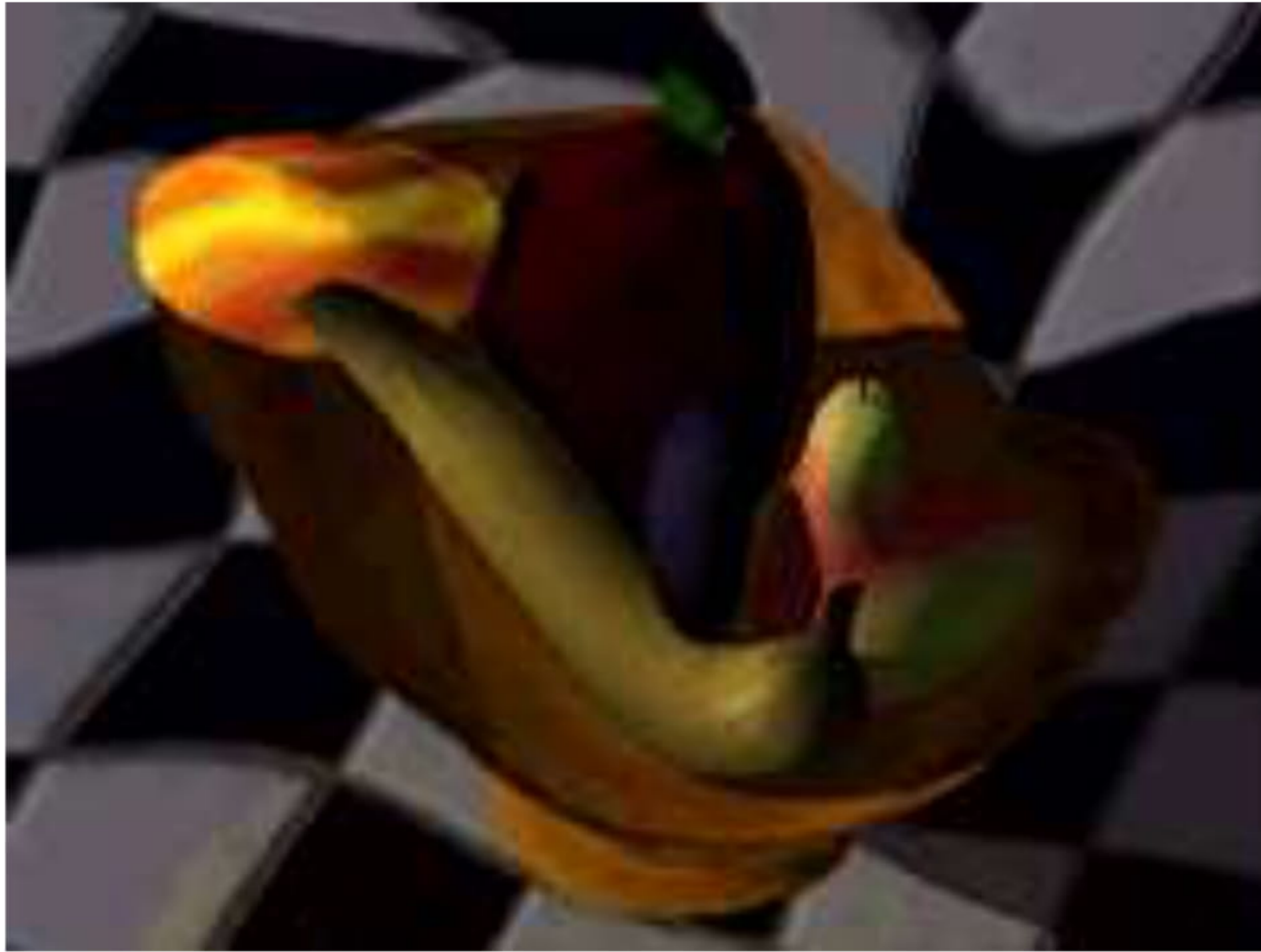
Figure: A warped version of the original

A morph looks as if two images melt into each other with a very fluid motion. In technical terms, two images are distorted and a fade occurs between them.