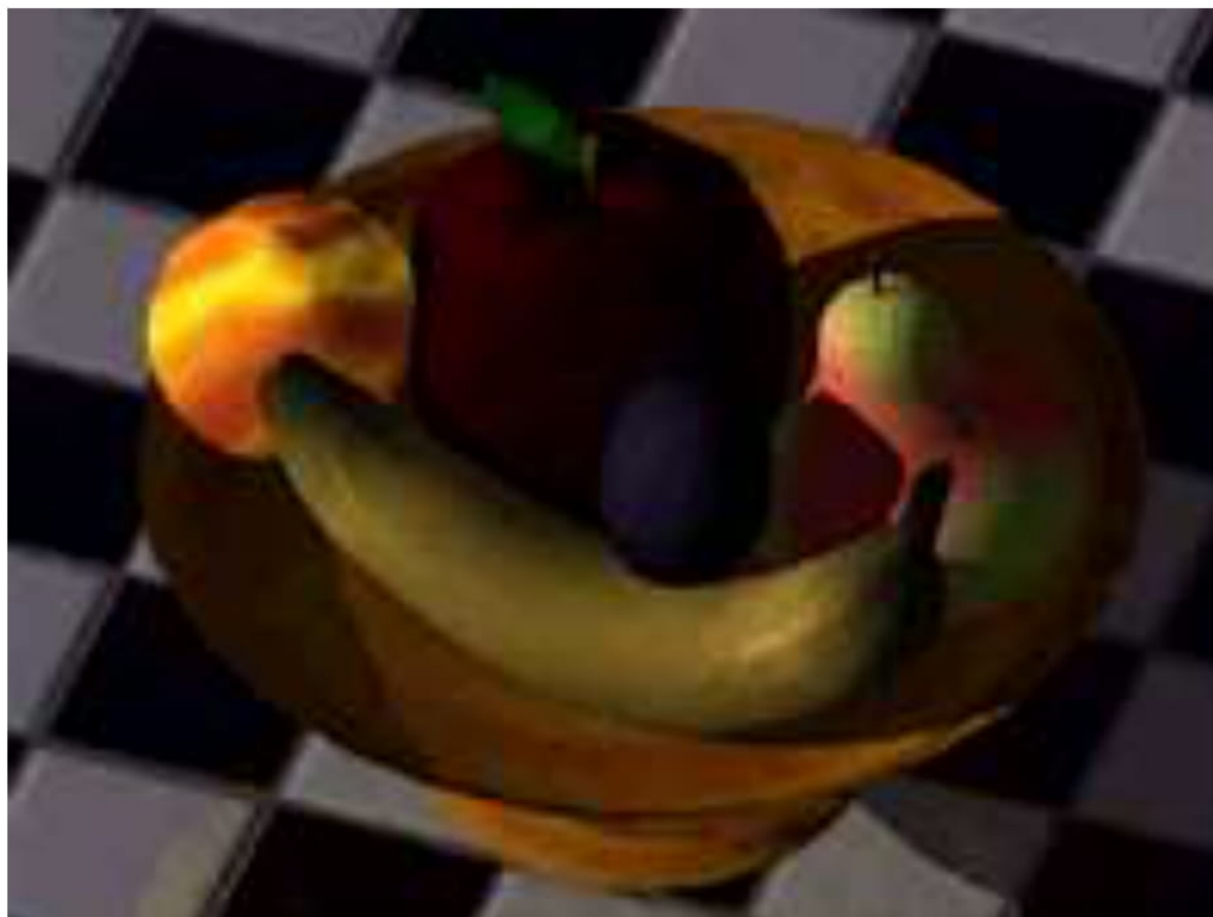
Figure: Original graphics

The transformation of object shapes from one form to another form is called morphing. It is one of the most complicated transformations.