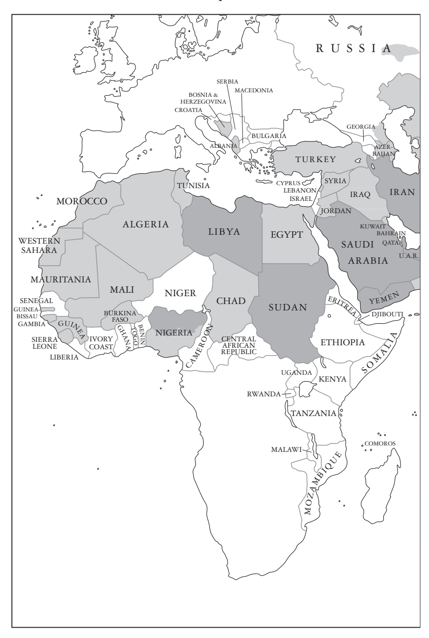
Map 2. Countries implementing Shari'a criminal law (dark grey)