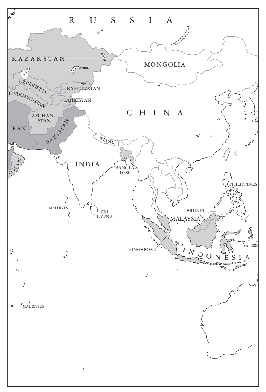
Map 2. (cont.)