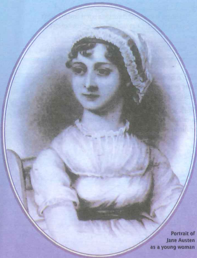
Portrait of Jane Austen as a young woman

(1) ... In her lifetime she never once travelled abroad, indeed she hardly ever left the south of England. When she died in 1817, only four of her six novels had been published, all anonymously, and she had earned a grand total of £648.65 (about $1,000) from her books. Now, nearly 200 years later, sales of her novels reach 35,000 a week. There have been film and television productions of not only Pride and Prejudice but also Emma , Persuasion , Northanger Abbey , Mansfield Park and the Oscar-winning Sense and Sensibility .