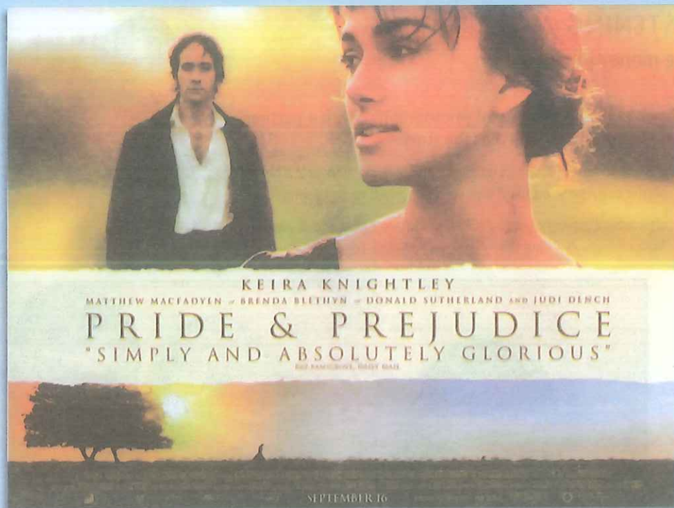
A poster for the 2005 film of Pride and Prejudice

In 1816, Jane Austen fell ill with a disease of the kidneys. She died on July 18, 1817, in the arms of her sister, Cassandra. She was only 41.