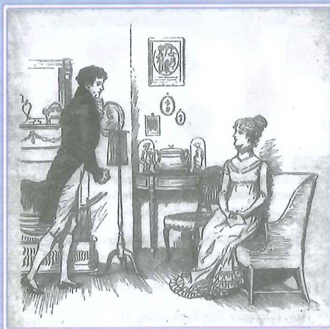
An 18th century engraving of a scene from Pride and Prejudice

The influence of cinema and (6) ... People see the movie and then read the book. Pride and Prejudice was voted in a BBC poll in the UK 'the book the nation cannot live without.' The actress Emma Thompson, who adapted Sense and Sensibility for the screen, went to Jane Austen's grave in Winchester to say thank you for the Hollywood Oscar she won for the film. As she said at the Oscar ceremony in Los Angeles, 'I do hope Jane knows how big she is worldwide.'