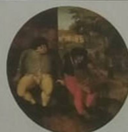
Cheating Benefits its Master by Peter Breugel