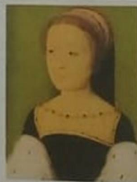
Madeleine of France by Cornille de Lyon

Both mother and son are now in prison for many years.