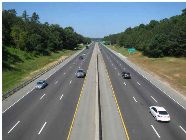
Figure 1.2: a- Rural arterial road