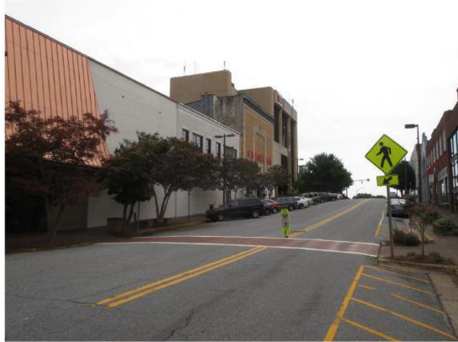
Figure 1.4: Local Street