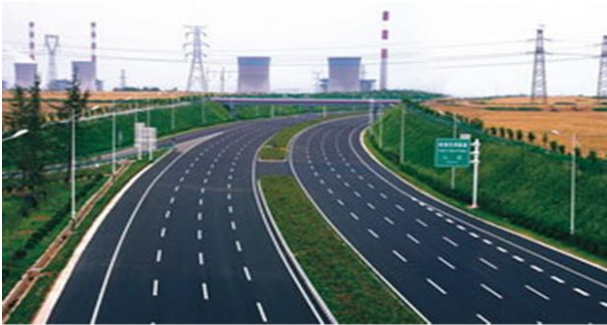
Figure 1.1: Freeway, Express or Motorway