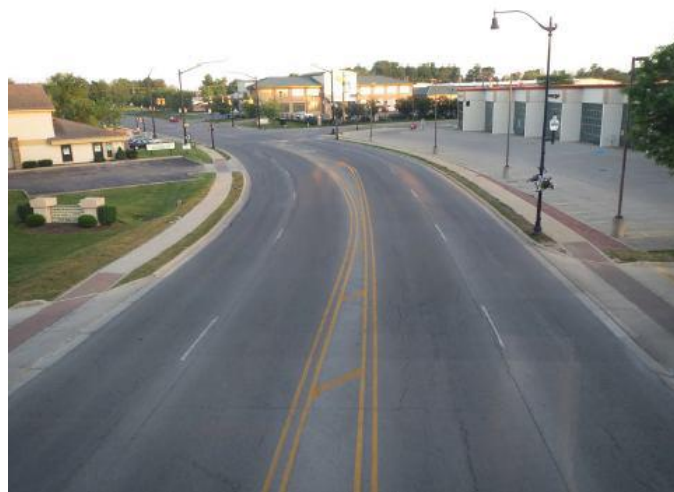
Figure 1.3: Collector road