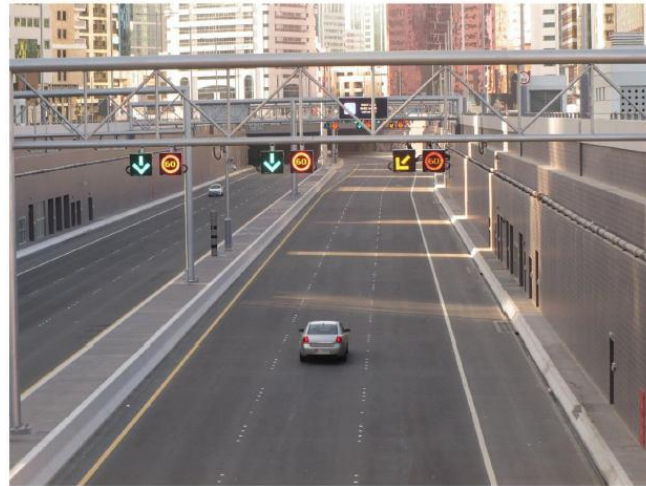
Figure 1.2: b- urban arterial road