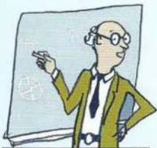
1 a teacher

a doctor a nurse a student a teacher a shop assistant a bus driver a businessman a police officer a builder