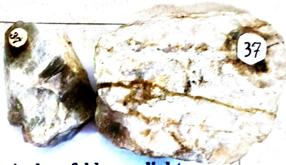
Plagioclase feldspar -light colored - Albite - Oligoclase