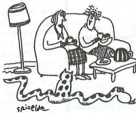
'How is the cat getting on with your new pet snake?'