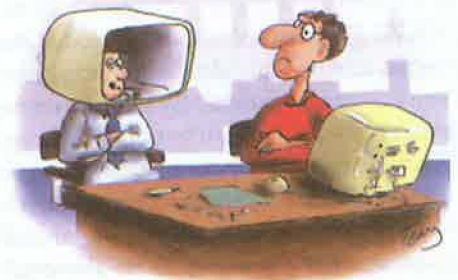
'It's the only way I can get the kids to take notice.'