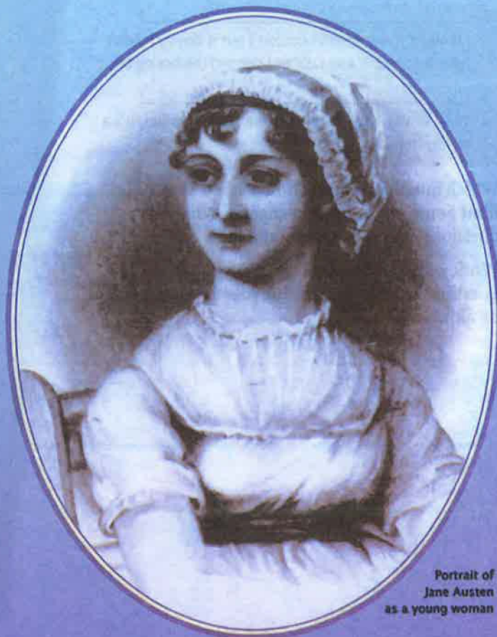
Portrait of Jane Austen as a young woman

(1) ... In her lifetime she never once travelled abroad, indeed she hardly ever left the south of England. When she died in 1817, only four of her six novels had been published, all anonymously, and she had earned a grand total of £648.65 (about $1,000) from her books. Now, nearly 200 years later, sales of her novels reach 35,000 a week. There have been film and television productions of not only Pride and Prejudice but also Emma , Persuasion , Northanger Abbey , Mansfield Park and the Oscar-winning Sense and Sensibility .