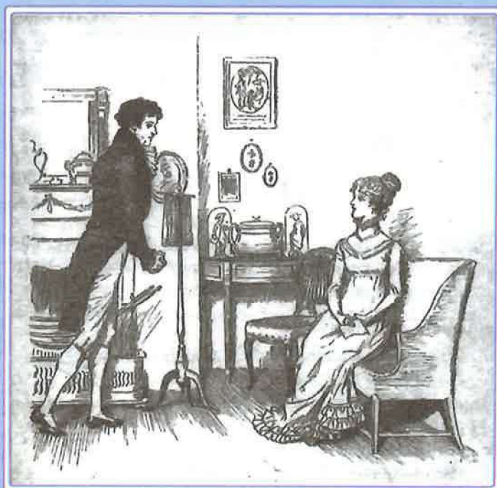
An 18th century engraving of a scene from Pride and Prejudice

The influence of cinema and (6) ... People see the movie and then read the book. Pride and Prejudice was voted in a BBC poll in the UK 'the book the nation cannot live without.' The actress Emma Thompson, who adapted Sense and Sensibility for the screen, went to Jane Austen's grave in Winchester to say thank you for the Hollywood Oscar she won for the film. As she said at the Oscar ceremony in Los Angeles, 'I do hope Jane knows how big she is worldwide.'